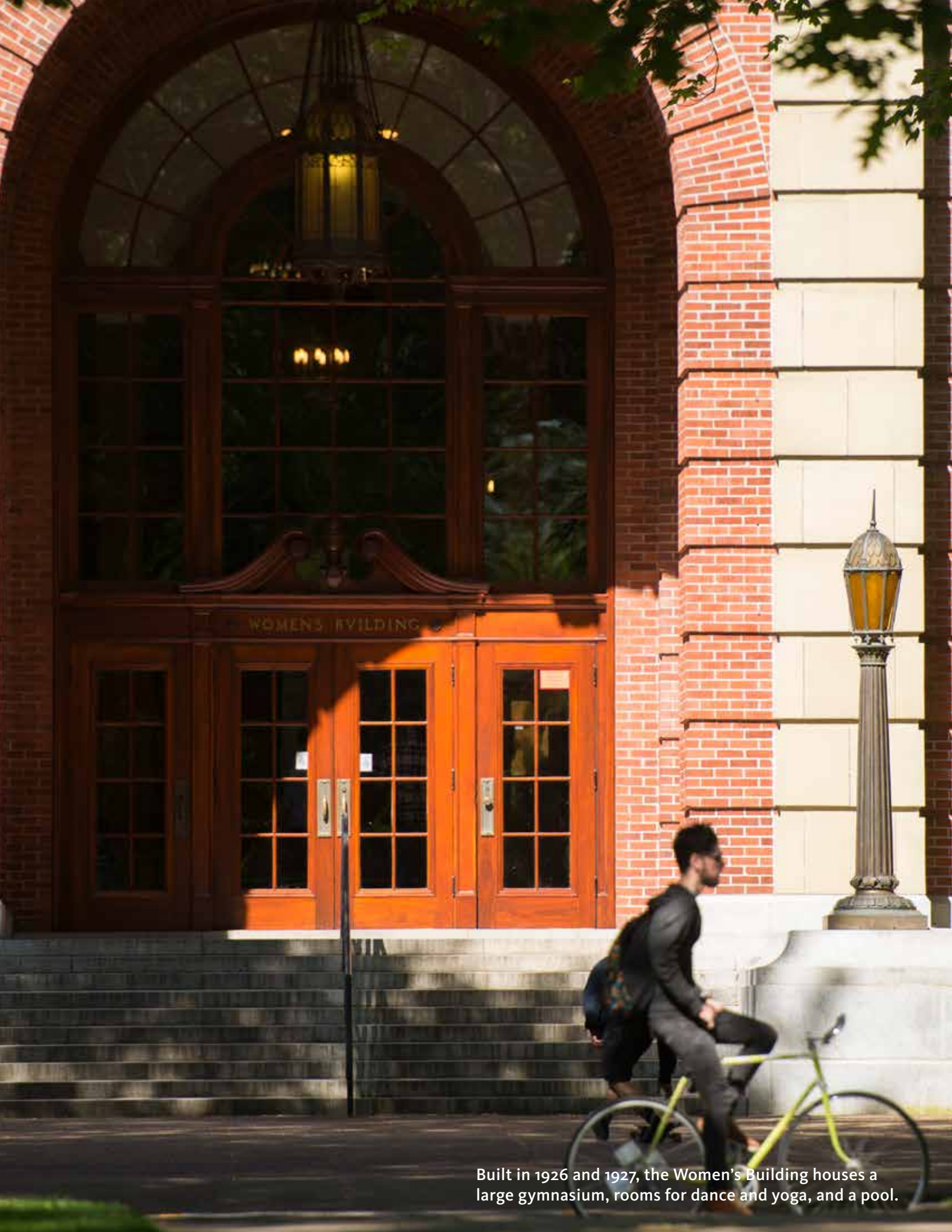
Built in 1926 and 1927, the Women's Building houses a large gymnasium, rooms for dance and yoga, and a pool.