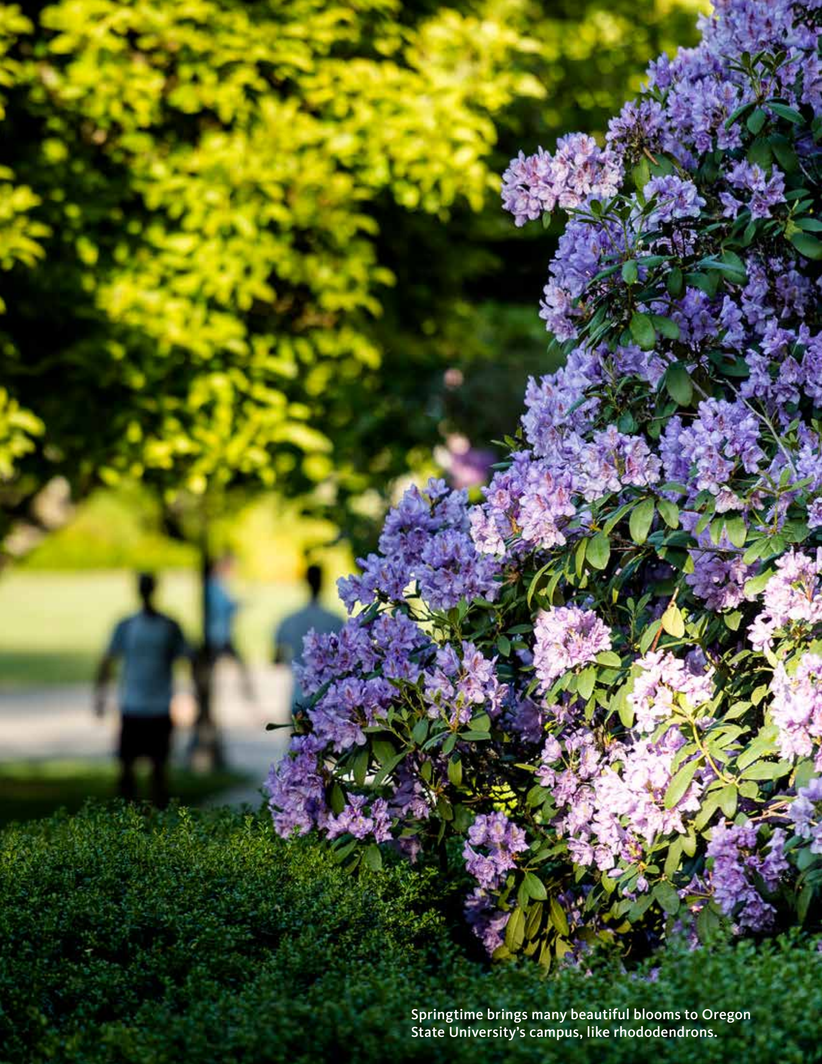
Springtime brings many beautiful blooms to Oregon State University's campus, like rhododendrons.