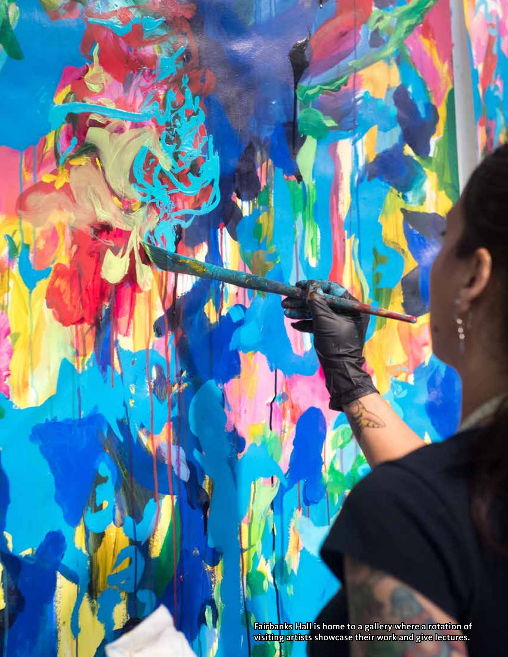
Fairbanks Hall is home to a gallery where a rotation of visiting artists showcase their work and give lectures.