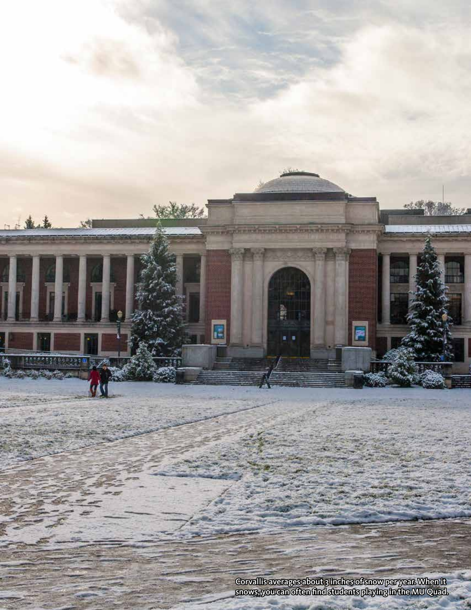
Corvallis averages about 3 inches of snow per year. When it snows, you can often find students playing in the MU Quad.