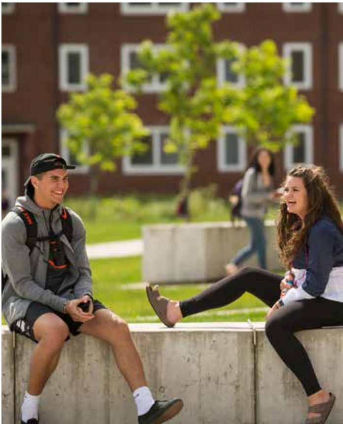
Published by New Student Programs & Family Outreach B122 Kerr Administration Building, 541-737-7627 newstudents.oregonstate.edu